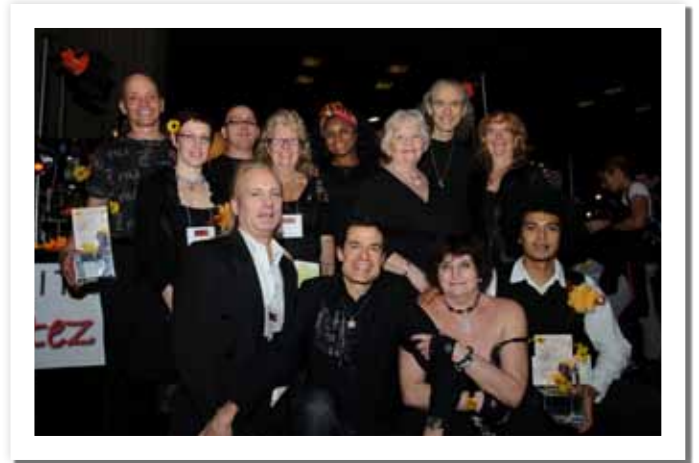
Clitoraid fundraising in Montreal