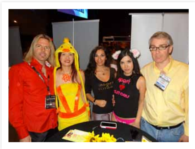
Clitoraid fundraising in Las Vegas