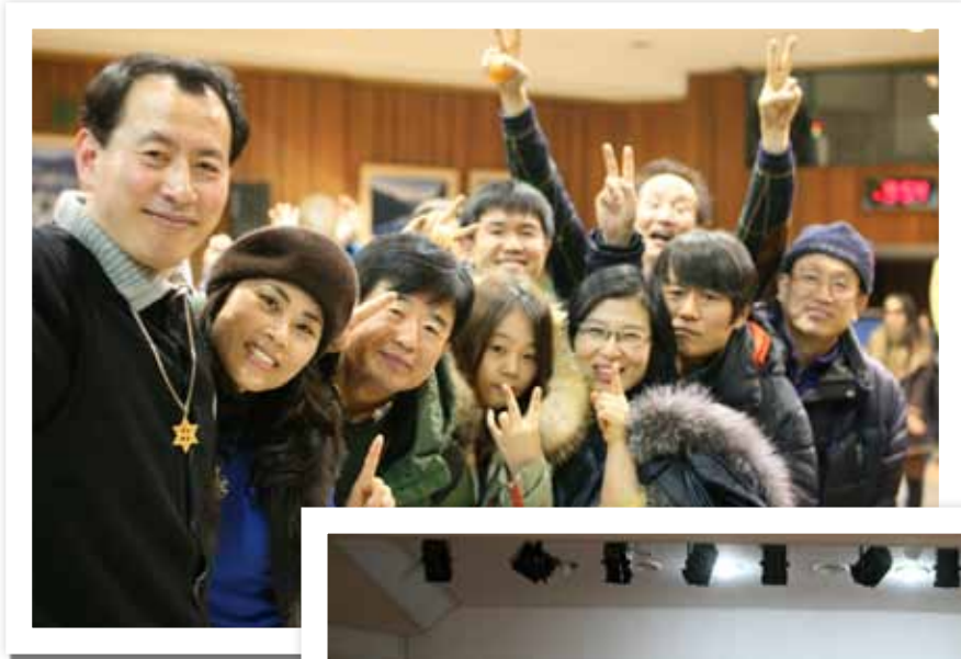
The Korean team had their national gathering in January. Meditation and laughter... and the pleasure to be together!