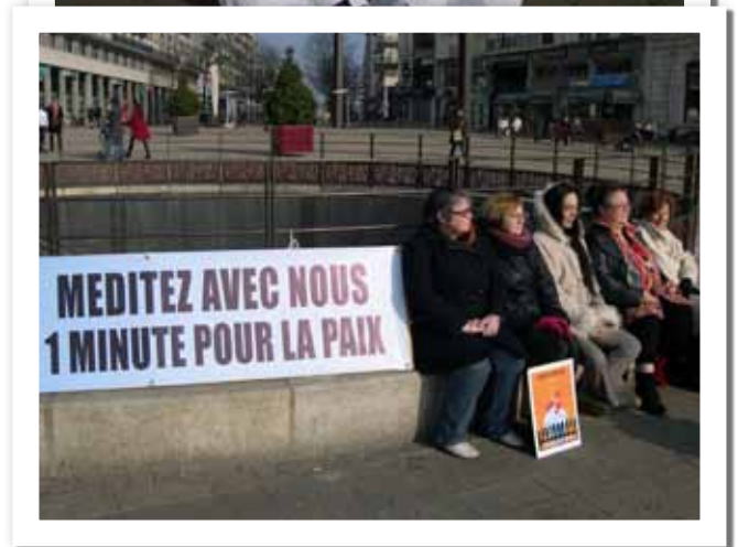
Meditation for peace in Angers, France