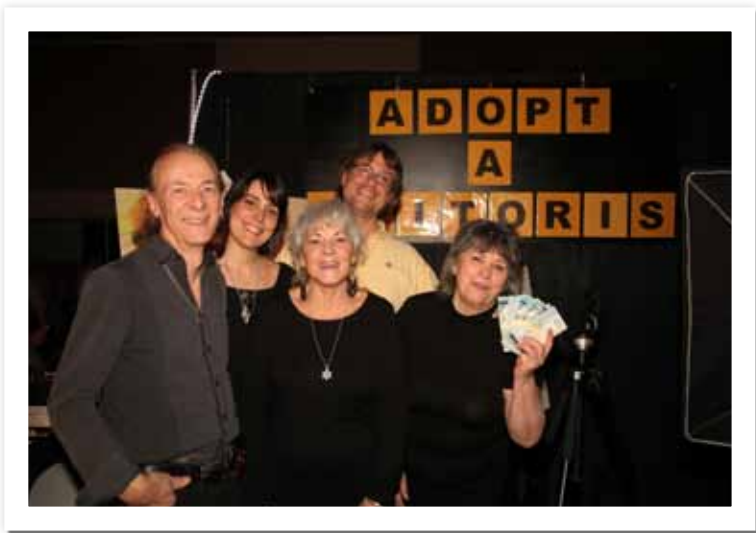
Clitoraid fundraising in Ottawa