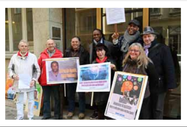
The Lyon team :-)