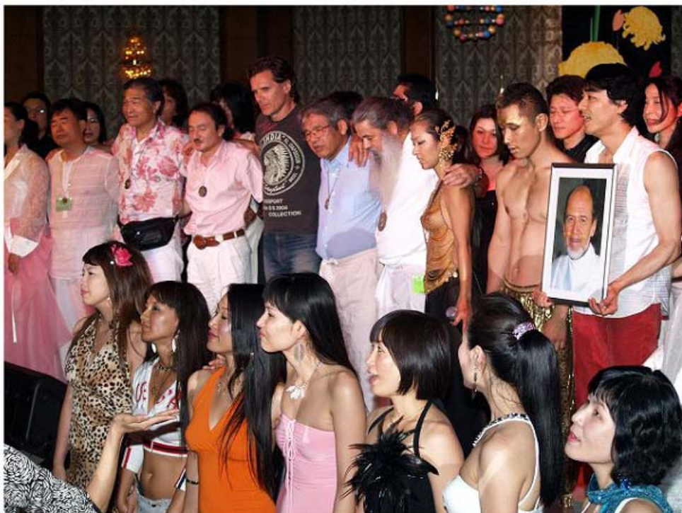
Singing Elohim at the end of the Asian seminar