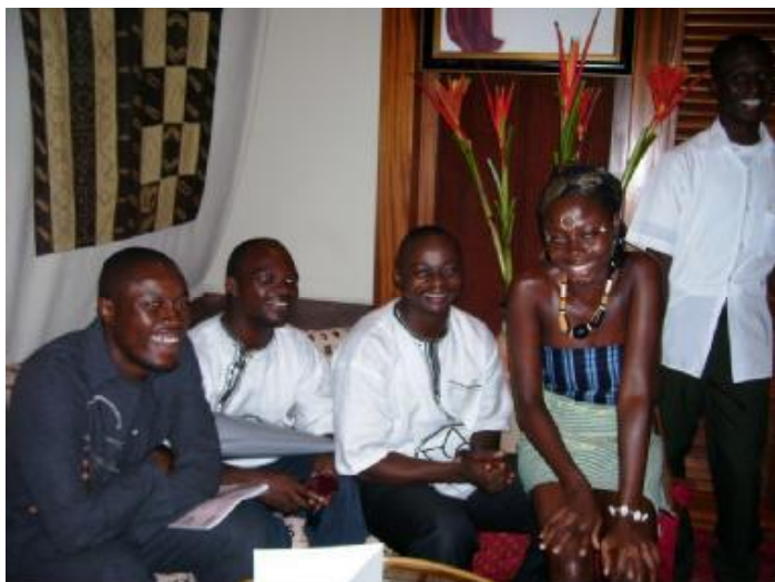
the organizing team