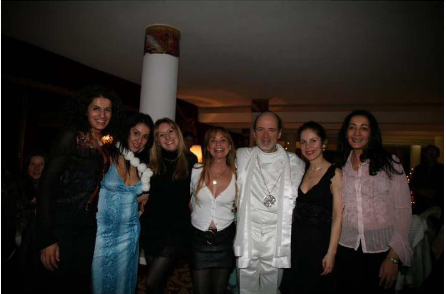
Our Beloved Prophet well surrounded during the December 13th celebration in Crans Montana J

am happy with the Raelians." You live this pleasure because you know that you can leave it. But if you quit, you wouldn't be completely yourselves anymore.