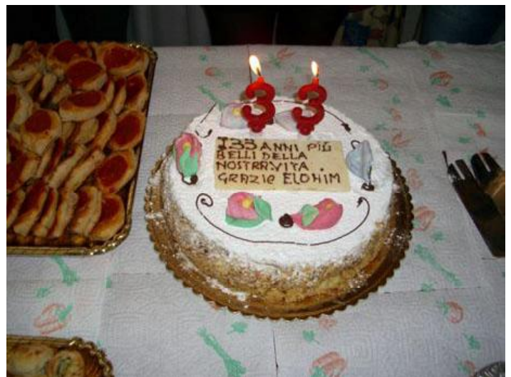
No comments ;-)