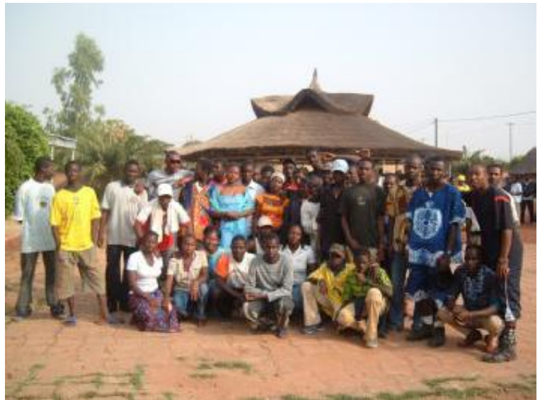
The 69 new Raelians