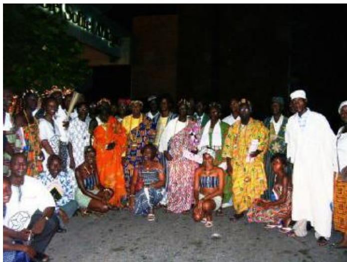
colorful party afterwards