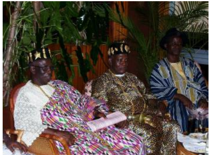
A few Traditional Chiefs visiting our Beloved Prophet in Abidjan.